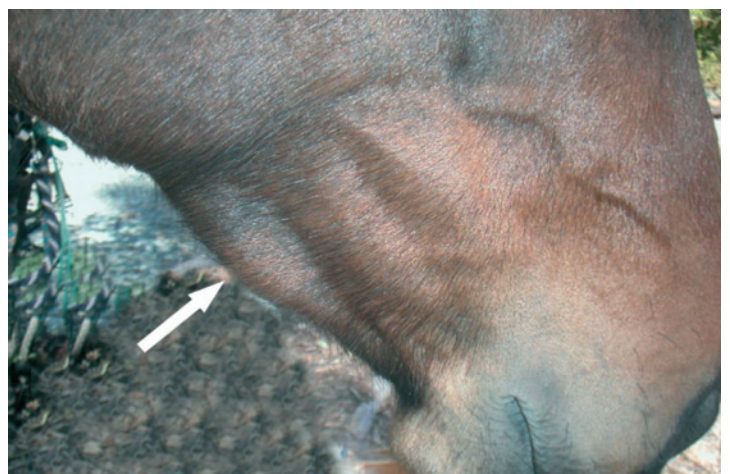
This five year old horse has 'tooth bumps' in the lower jaw line which will disappear as the teeth begin to wear inside the mouth.