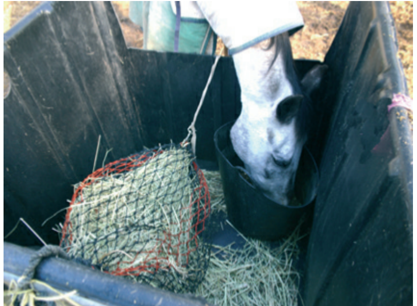
The food of domestic horses causes different wear patterns of the teeth to that of wild horses.

Some of the signs of dental problems include:-